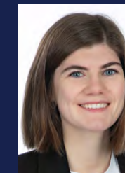
UNTIL 2024 BRIMAIRE JIL LOGISTICS DEVELOPMENT ADVISOR