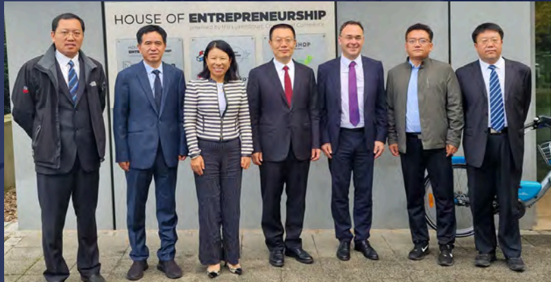
26.11. Henan Province Delegation meets C4L